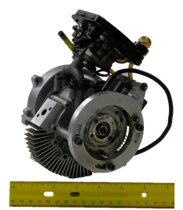
27 size - compared with ruler