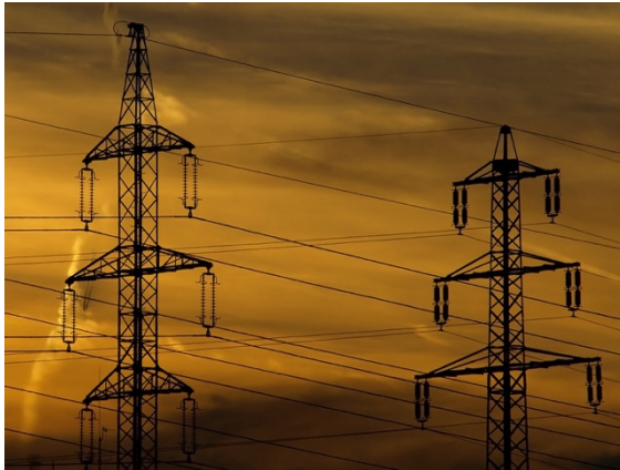
Transmission Power Grid